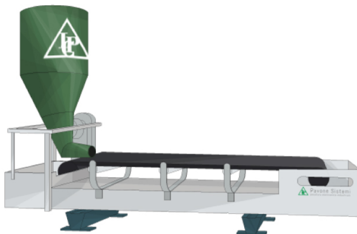
Example of use on belt weighing